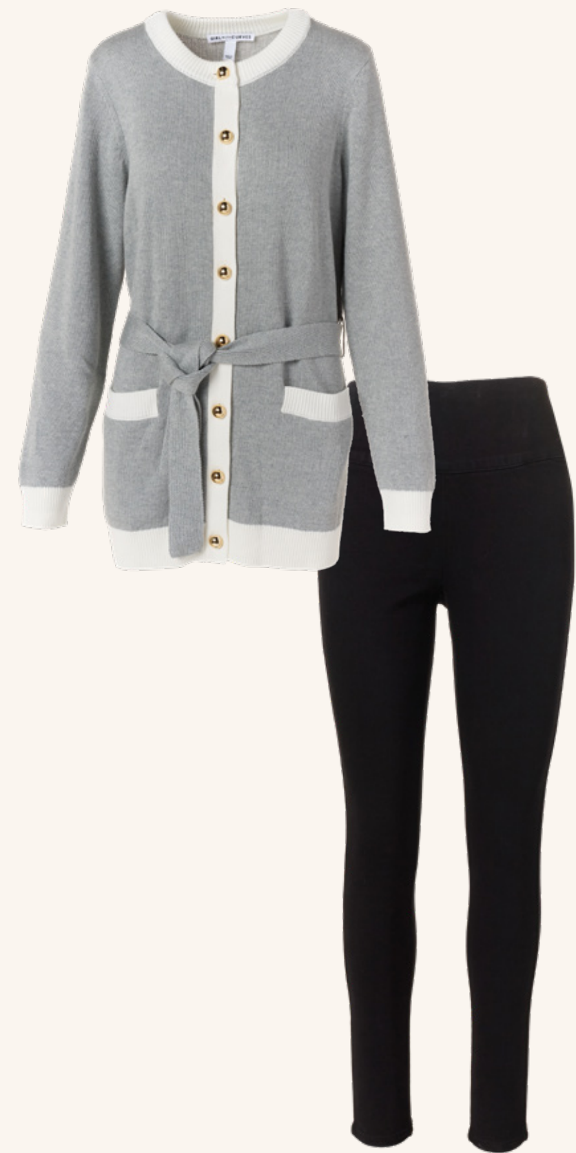
GOLD BUTTON CARDIGAN