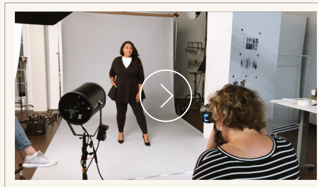
GWC DESIGN PHILOSOPHY [1:33]