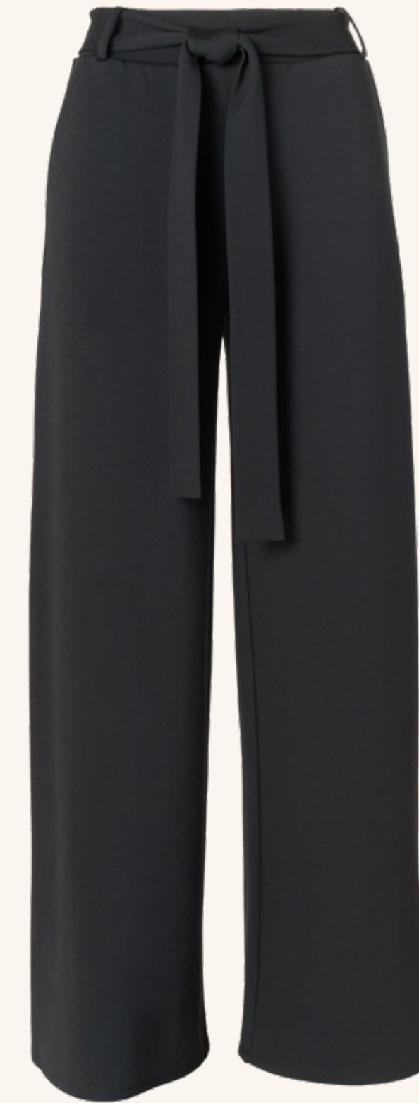
WIDE LEG PONTE PANT