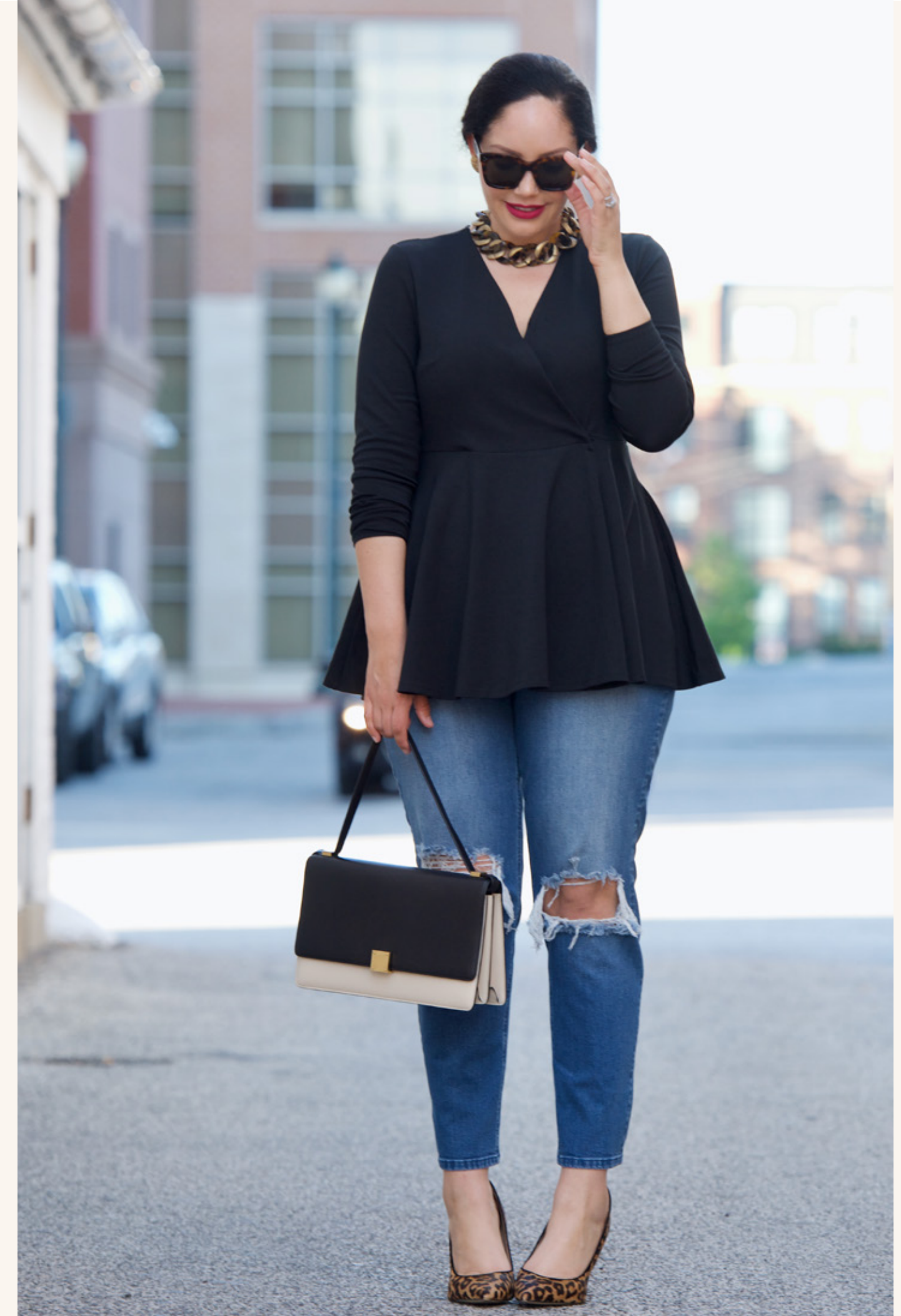
PONTE PEPLUM BLAZER A452277 | BLACK, IVORY, NAVY