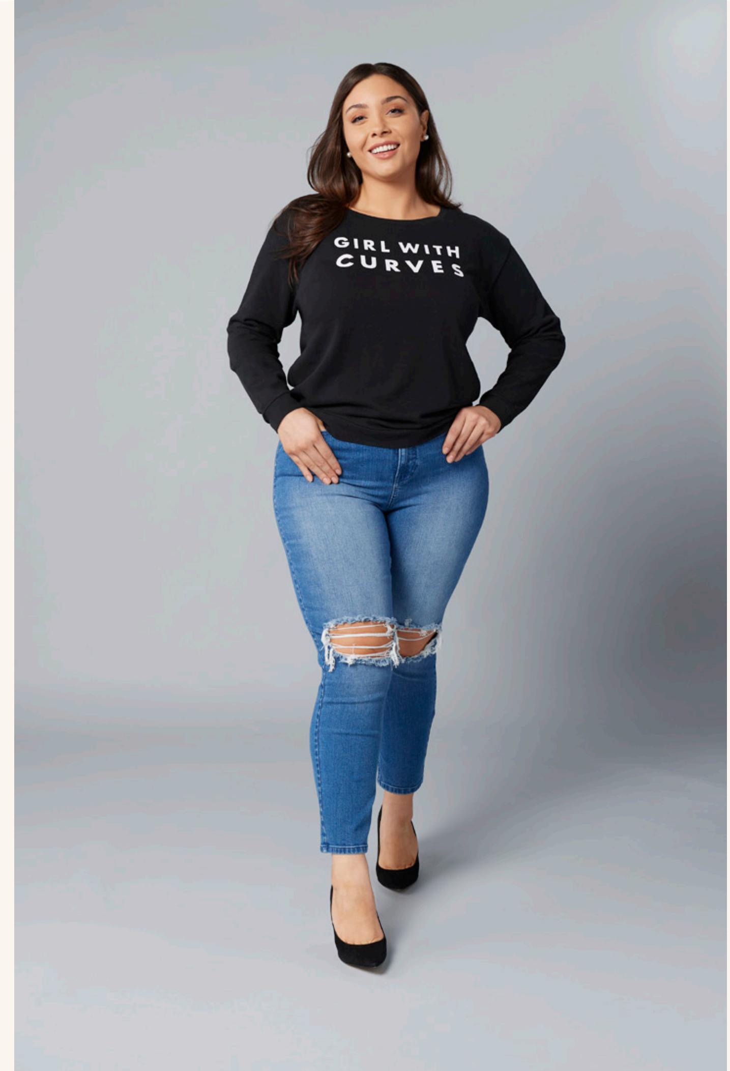
GWC FRENCH TERRY SWEATSHIRT