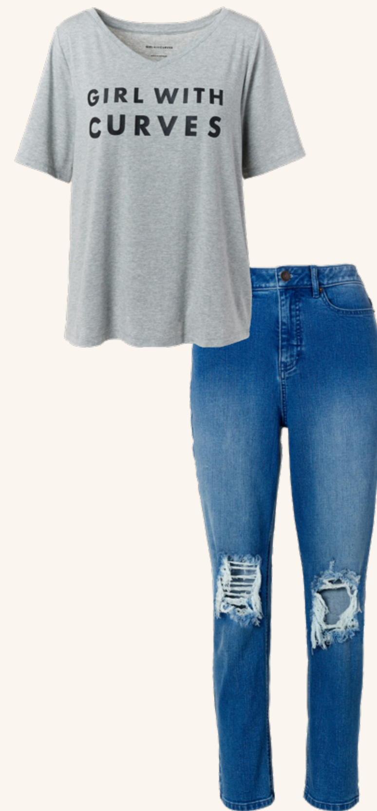
GWC SCREENPRINT V-NECK TEE