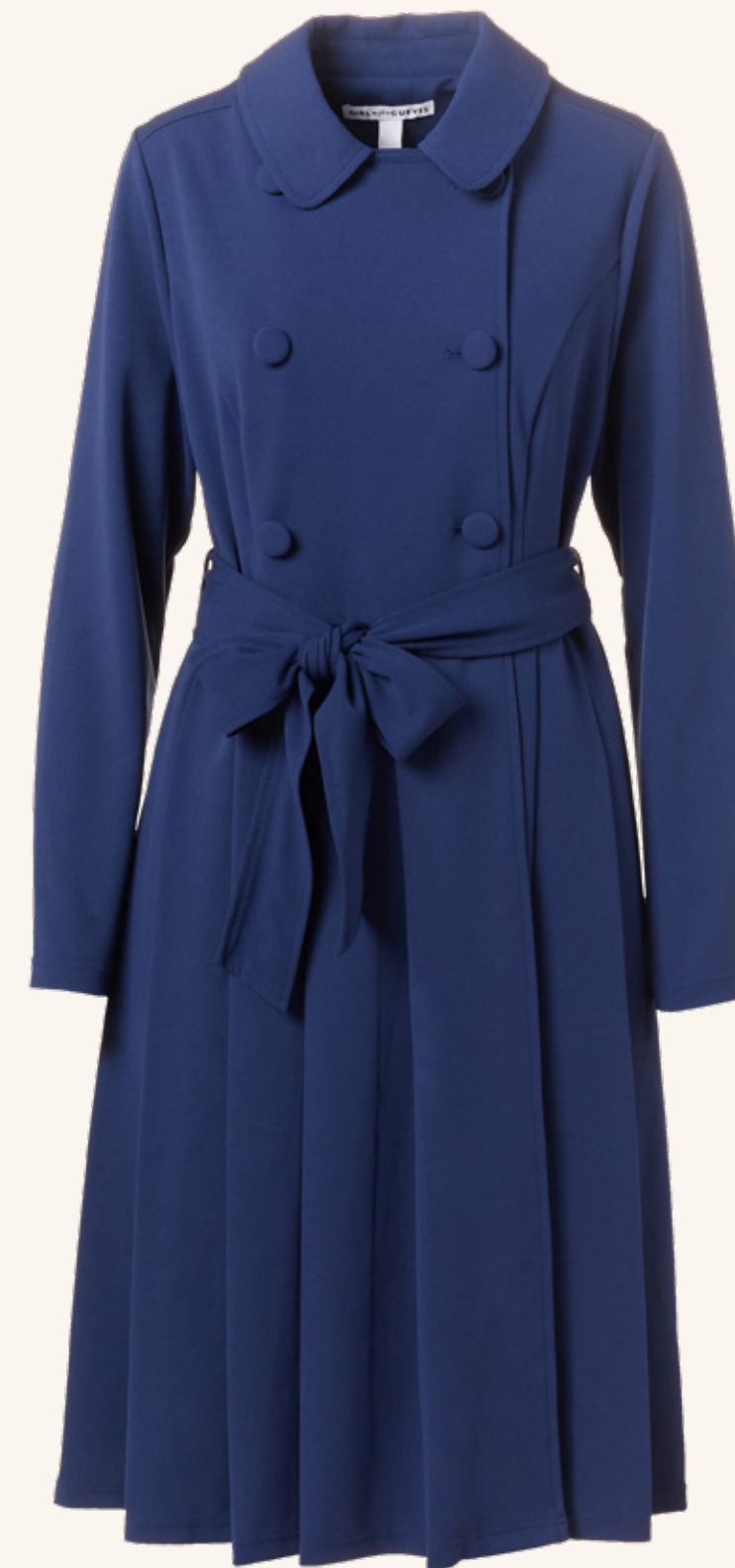
KNIT TRENCH DRESS