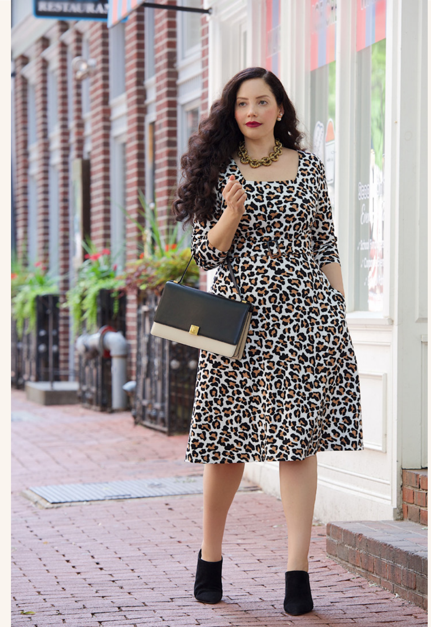
PONTE MIDI DRESS WITH SELF BELT