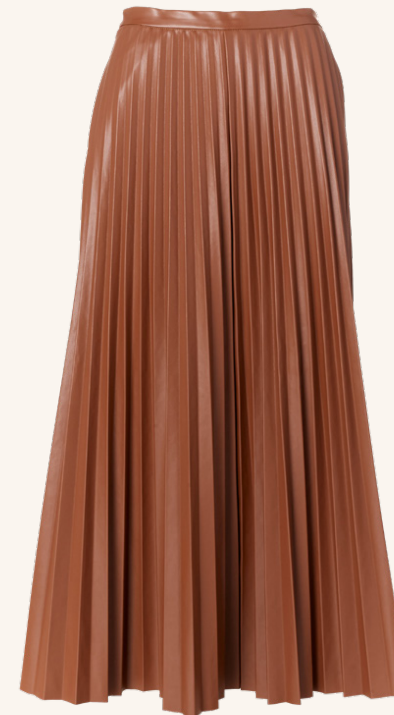
FAUX VEGAN LEATHER PLEATED ANKLE SKIRT